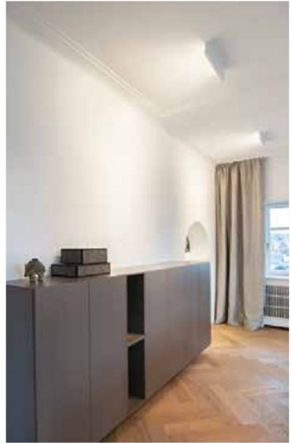
Project: Private residence | Austria

LED Aufbauleuchte aus Aluminium Weiß oder schwarz pulverbeschichtet Asymmetrischer mikrofacettierter Freiformflächenreflektor Gleichmäßiges Licht mit sehr guter Längsentblendung Energieeffiziente LED, inkl. Konverter