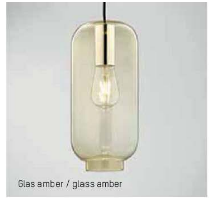
Glas amber / glass amber