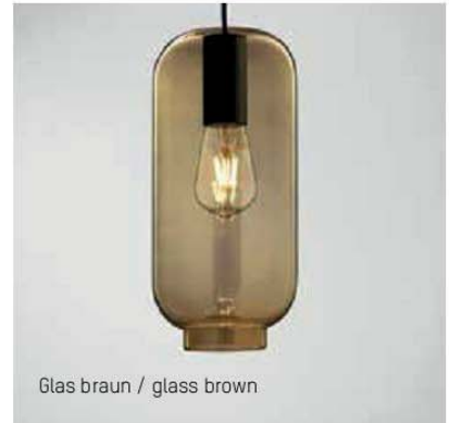
Glas braun / glass brown

Dekorative Hängeleuchte im Retro-Design Hochwertiger Glasschirm mundgeblasen in 3 Farben Speziell konstruierte Fassung für bündigen Montage Abhängung in 2 Farben erhältlich Glasschirm separat ordern