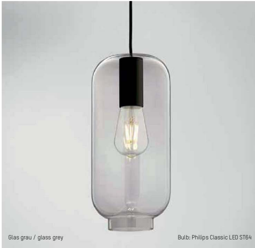
Glas grau / glass grey