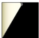
RDB asymmetrical reflector by Bartenbach