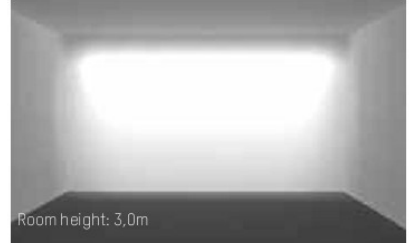
Room height: 3,0m