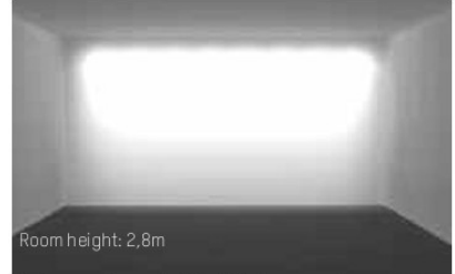
Room height: 2,8m