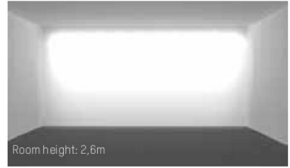
Room height: 2,6m